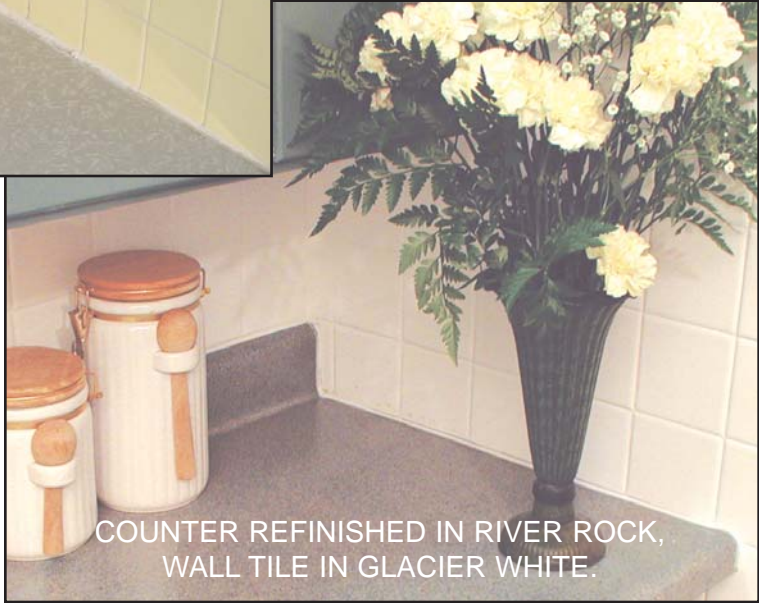
COUNTER REFINISHED IN RIVER ROCK, WALL TILE IN GLACIER WHITE.