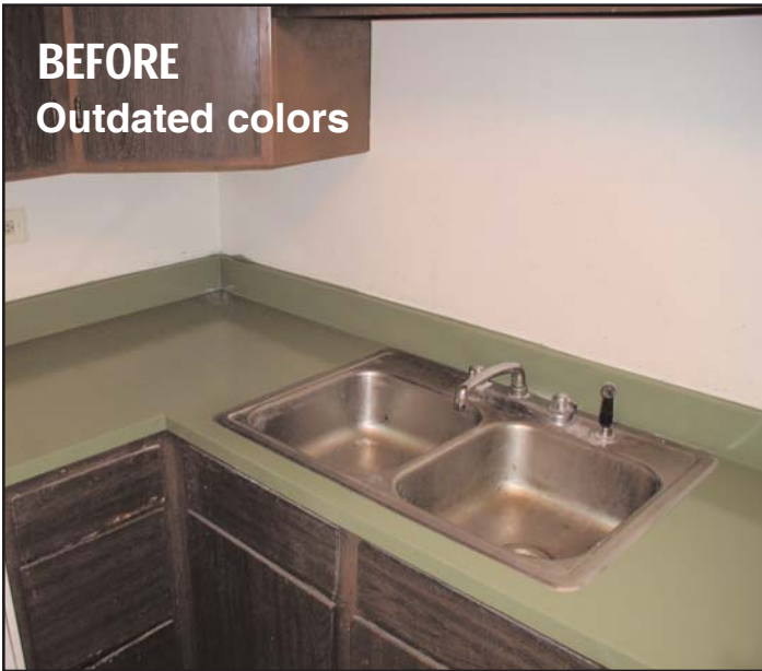
BEFORE Outdated colors